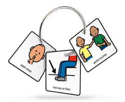
The Picture Communications Symbols ©1981– 2014 by Mayer-Johnson, LLC. All Rights Reserved Worldwide. Used with permission.

Flip book: Visual support that is small and portable (e.g., can fit on a key ring or a lanyard). The flip book can be carried by the teacher or the child in different settings and can be pulled out to remind the child of the rules.