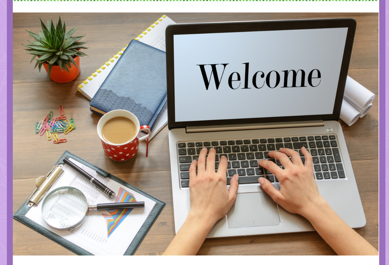
For Faculty: Online Course Design and Delivery

instructional concerns. It tackles more basic considerations, too, like how to set up a learning space for your child, or ways to reduce distractions during learning time.